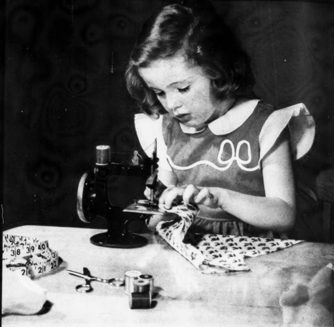
Photograph by Pandolfi