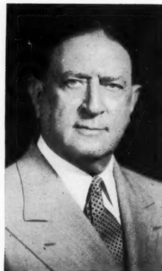
Admiral Ben Moreell

What's more important, his interior lines of communication are in excellent shape. From his early school days, he has always been a voracious reader, and studies came easy to him. He took his degree in engineering at Washington University, St. Louis, and found time to work on the outside and also to star in athletics. After his graduation in 1913, Moreell was employed as Designing Engineer, and as Resident Engineer on construction projects, by the City of St. Louis. In 1917 he took a competitive examination for a commission in the regular Navy, received a brief indoctrination course at Annapolis, and was in. His first assignment in the Civil Engineer Corps was as Assistant